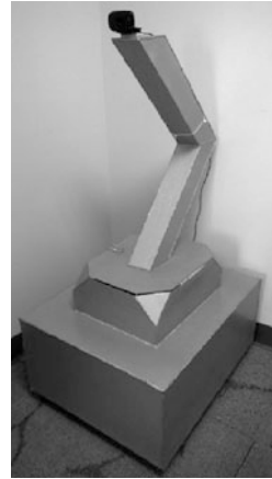
Fig. 1 Custom-designed and custom-built robot used in the present study